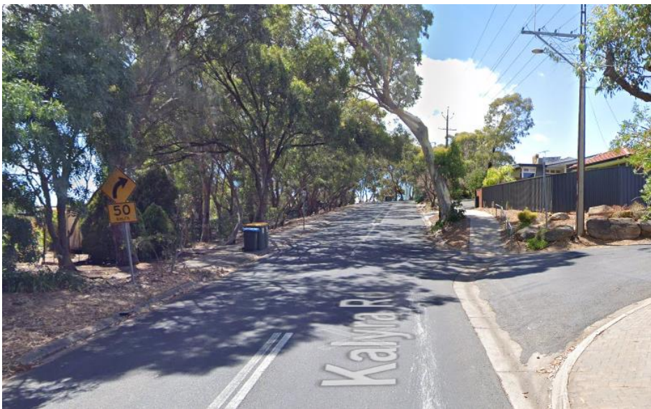
Advisory speed sign, intersection of Kalyra Rd and Scenic Ct

It was raised with Bike Adelaide by some local Mitcham cyclists that there is only one speed sign on Kalyra Rd which is an advisory speed sign for a bend, marking 50kph. It is unusual for an advisory sign to be the same speed as the nominal speed limit. We suggest this advisory speed may contribute to a perception that the actual speed limit is higher than 50kph. Consequently Bike Adelaide feels this sign is misleading to motorists and contributes to them exceeding the speed limit along the rest of the road.