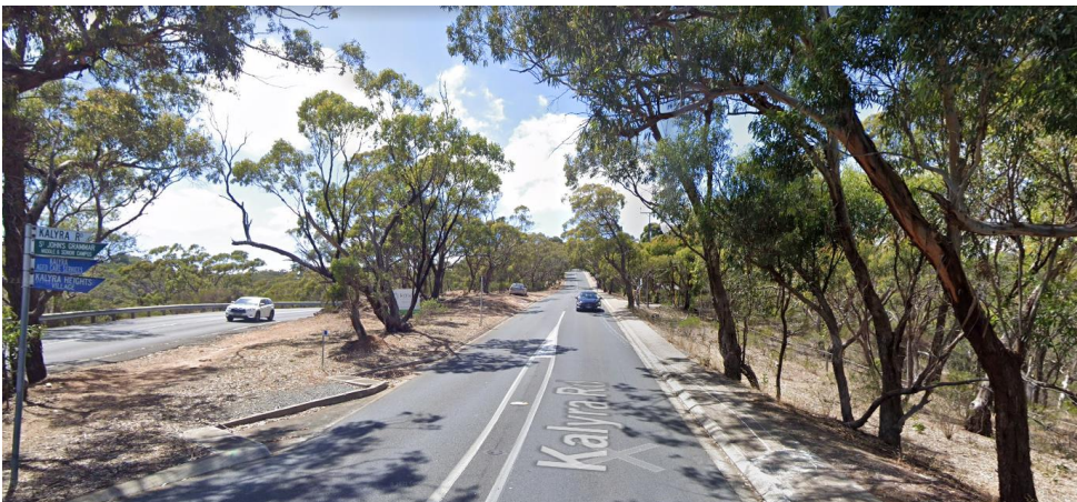
Kalyra Rd from the intersection of Old Belair Rd

Signposting should assist in reducing some instances of non-compliance where the speed limit is currently unclear, especially for motorists turning into Kalyra Rd from Old Belair Rd where the speed limit is 60kph. As Kalyra Rd only becomes residential part way up the road from this intersection, many motorists may not automatically assume a residential speed limit applies to that road. In the absence of speed limit signs or any visible development, it is not at all apparent that a change of speed limit is applicable. In the image below, it is not evident to a motorist entering from Old Belair Rd that Kalyra Rd is a residential street and that a residential road speed limit should apply.