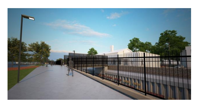
Artist view of shared use path towards Station Place bridge

The Mike Turtur bikeway overpass is in the planning phase.