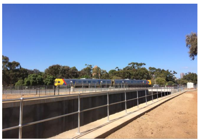
View of the new Bowden Railway station and Gawler train passing above the Torrens Junction bridge

On behalf of the ConneXion Alliance, we thank you and trust you will enjoy using the new station and its facilities.