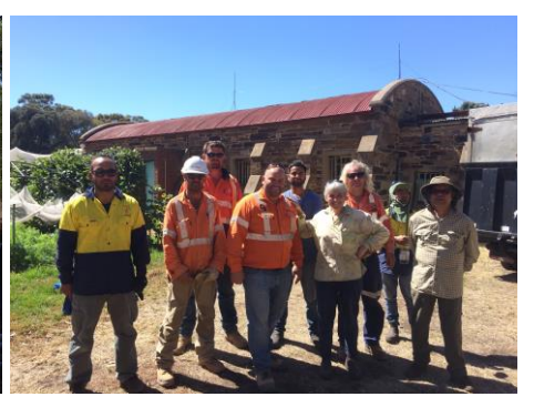
Recently, we donated some spare materials and a temporary shelter to the Roma Mitchell Garden.