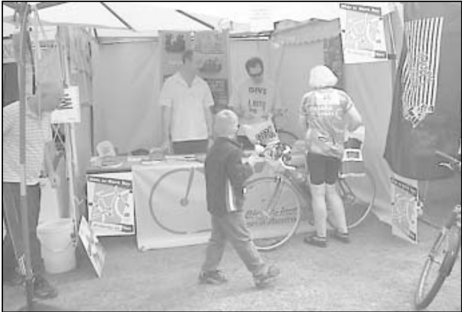
Velofest 2001: the BISA stand. Report on page 6