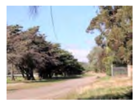
Readymade Race Course Cycling Space