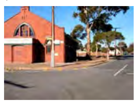
Buller Trc Cheltenham