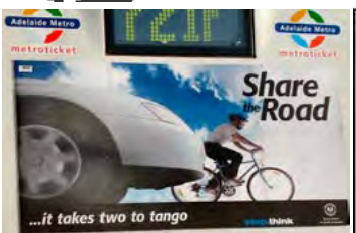
Sign on back of an Adelaide Bus