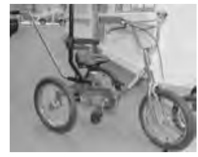
One of the Trikes on display at the AGM see page 9

Signs of the Times: BISA Cartoon Competition see Page 3