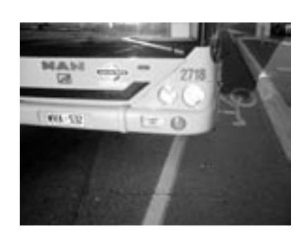
Abuse of Bike lanes see Page 10